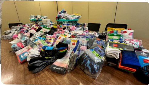
Lincoln Elementary School receives a donation of clothing essentials from their partner, SMM Health.