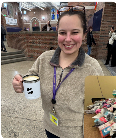
An East High staff member enjoys a latte during Summit Credit Union's 3rd annual teacher appreciation event.

Launched in 2005, the Adopt-a-School program is a prized source of stability for our schools and is deeply embedded in our approach to serving MMSD. We are the point of access, forging and facilitating these student-centered partnerships between MMSD schools and the community.