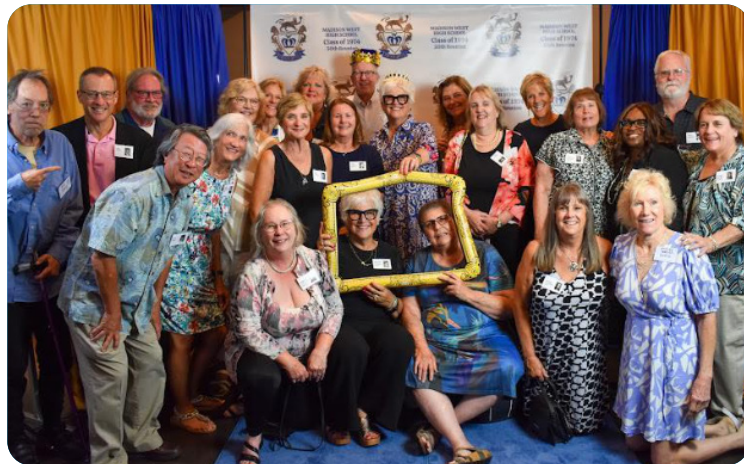
West High Class of 1974, one of many classes to make a gift to their alma mater, poses together at their 50th reunion.

Beyond bringing classmates back together, this initiative is strengthening our alumni database, ensuring we can engage even more graduates in the years ahead. Looking forward, we're expanding our outreach in 2025 and launching a Giving Challenge—a friendly competition among reunion classes to inspire philanthropy and collective impact.