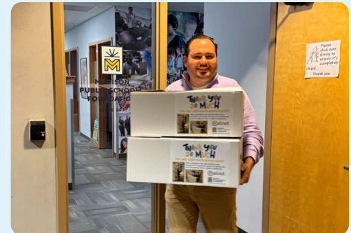
Black Hawk Middle School staff received conference day care packages created by Nelnet staff.